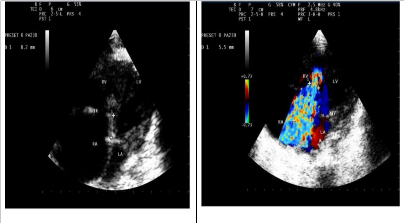
Figure 1: echocardiographic finding ( ASD, VSD, TR)