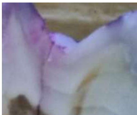
Figure 1. Dye penetration in the tooth/sealant interface under an optic microscope with a magnification of 10