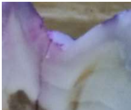
Figure 1. Dye penetration in the tooth/sealant interface under an optic microscope with a magnification of 10