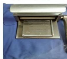
( figure : 3 ) mesher