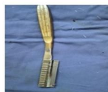
( figure : 1 ) Wike knife