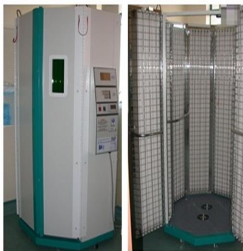
(Figure : 5) PUVA chambers