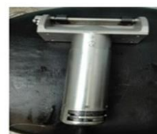
( figure : 2 ) Dermatoam