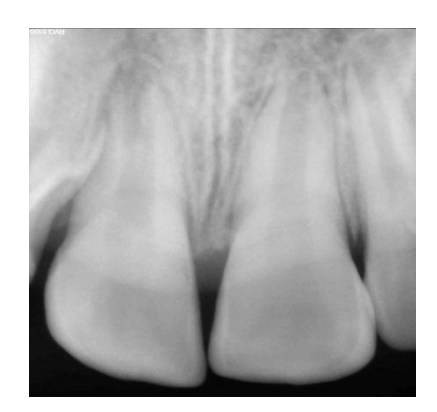
Figure 4: At 2-year follow-up, the periapical area of the left central incisor has remained normal.