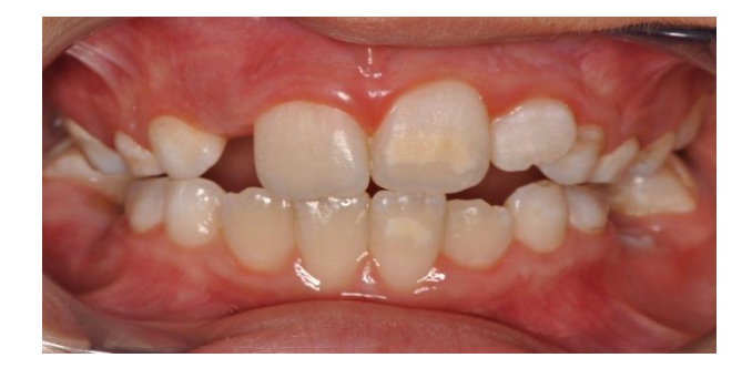
Figure 3: Upper left central and lateral incisors normally erupted after a 2-year follow-up.

Figure 2: Panoramic x-ray revealed delayed eruption of upper left central incisor.