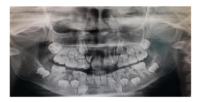
Figure 2: Panoramic x-ray revealed delayed eruption of upper left central incisor.