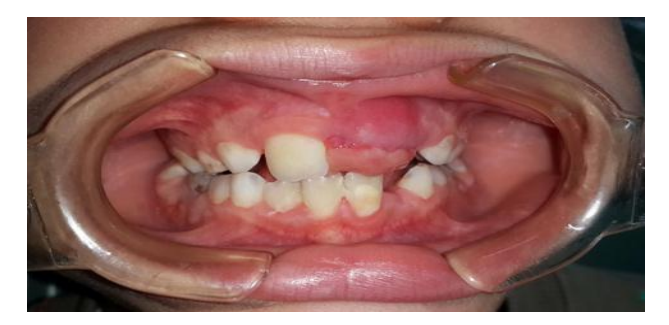
Figure 1: Localized gingival enlargement of the upper left maxilla.