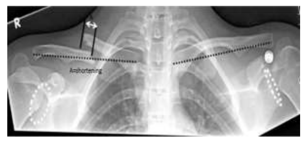
Figure 2 - How to calculate bone shortening in the case of an overlap.