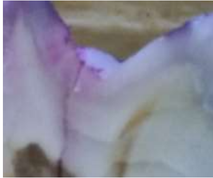
Figure 1. Dye penetration in the tooth/sealant interface under an optic microscope with a magnification of 10