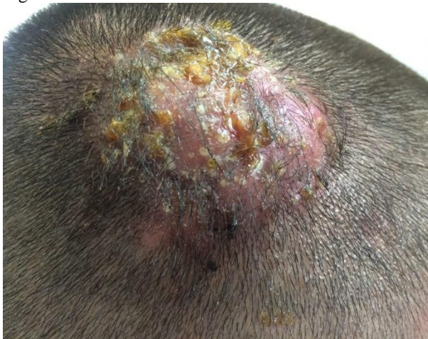
Figure 3: Case number 2 before treatment