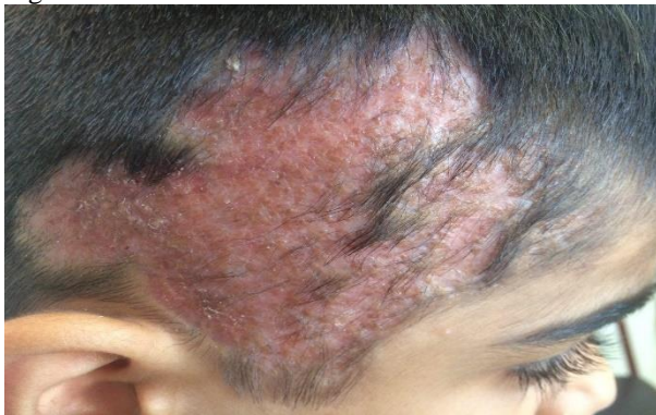
Figure 2: Case number 2 after treatment