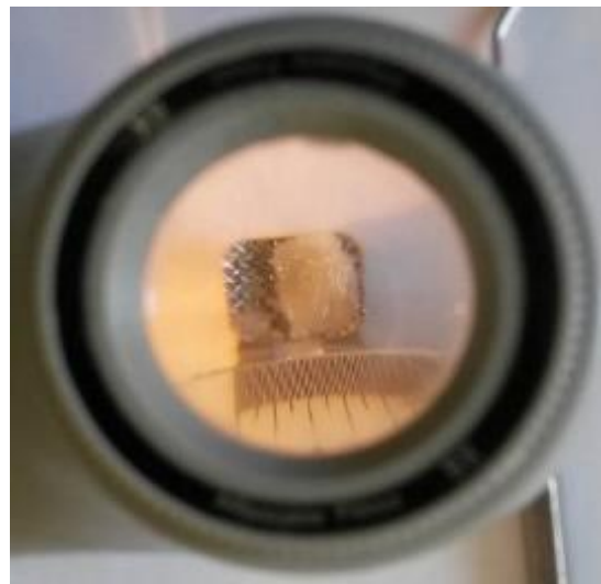
Figure 2: The magnifying glass used to visualize the ARI