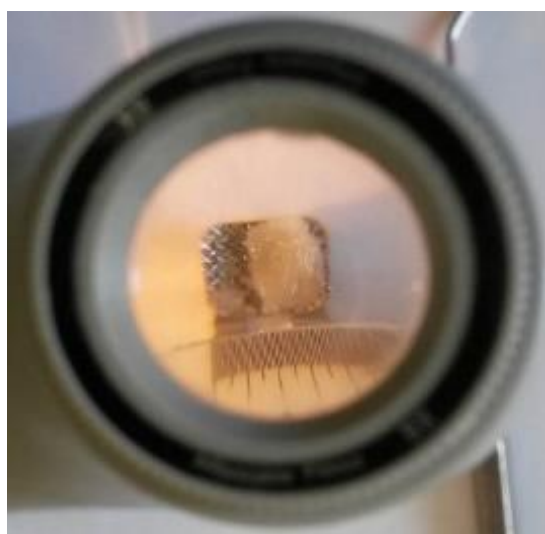
Figure 2: The magnifying glass used to visualize the ARI