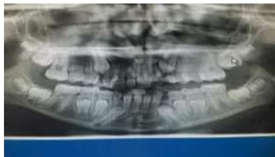
Figure 3 : Grown mesiodense between the two maxillary central teeth