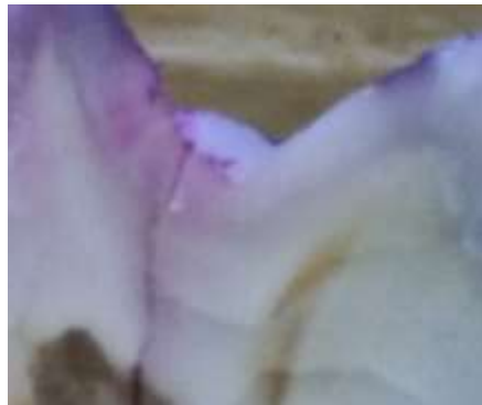
Figure 1. Dye penetration in the tooth/sealant interface under an optic microscope with a magnification of 10