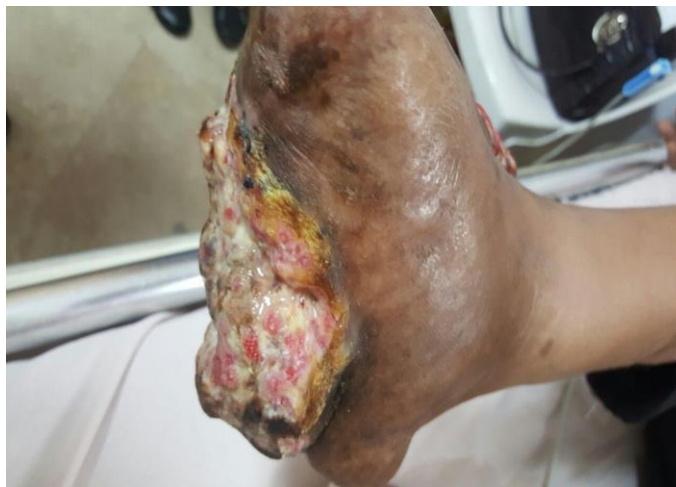
(Figure 1) : huge cream-brown cauliflower- like mass