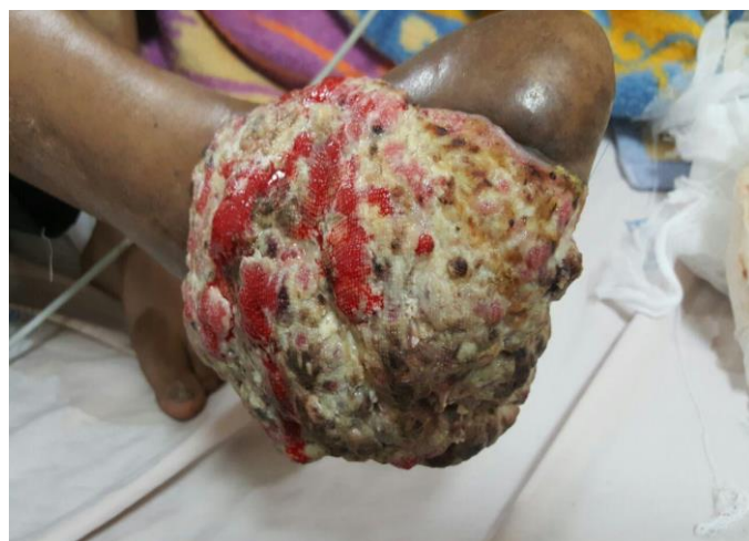
(Figure 2) : huge cream-brown cauliflower- like and ulcerative mass