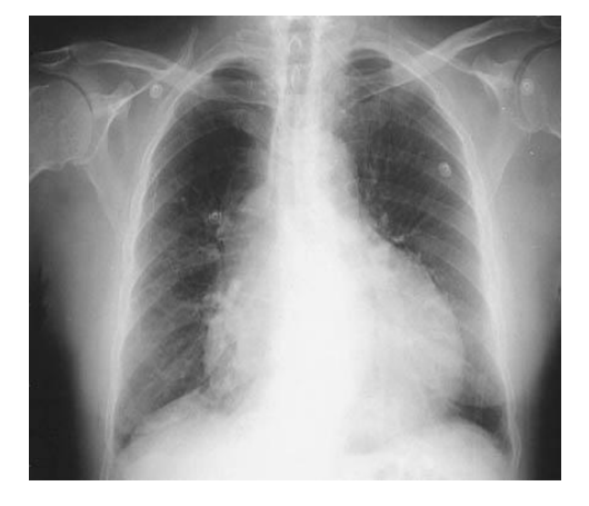
Figure 3: Posterior pericardial effusion impending tamponading