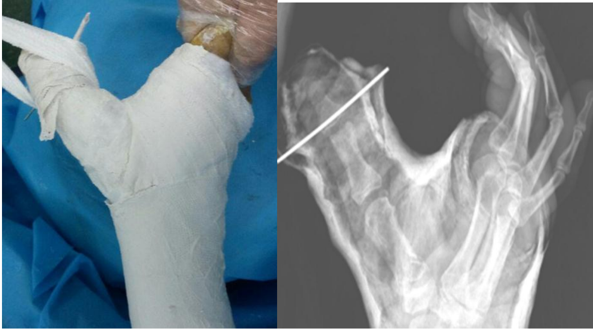
Figure 2: post optative x-ray.