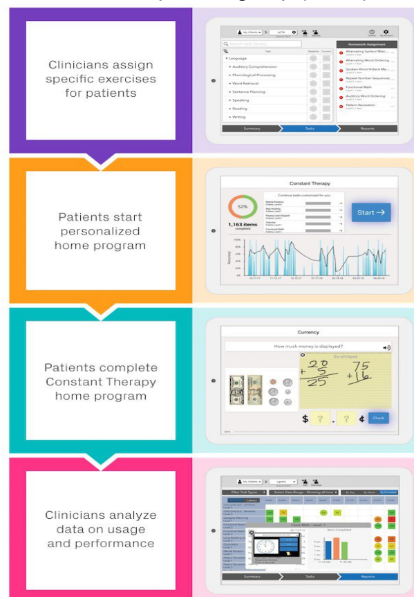
Figure 2. Constant Therapy overview

study were individual studies of the evidence level method (IIIa). In fact, in-group comparisons showed significant progress in different language tasks (e.g., oral comprehension, repetition, and written language) in the VR group alone. Significant gains, after treatment, in the virtual reality group, were also observed in various psychological dimensions (ie self-esteem and emotional state and mood) (31). Two other studies used the pre-study and post-study evidence level (IV) to determine whether remote health intervention facilitated participants' improvement of communication skills without a comparison group (32,36).